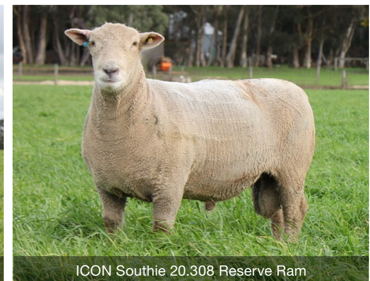
ICON Southie 20.308 Reserve Ram