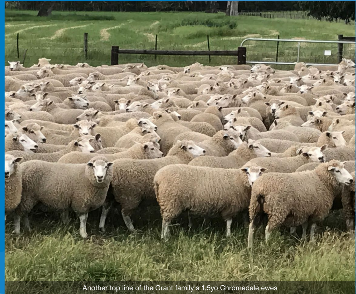
Another top line of the Grant family's 1.5yo Chromedale ewes

“They are rewarding sheep to own as they give you back so much of what you put into them.”