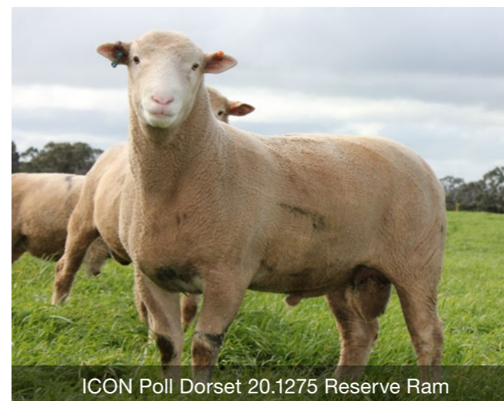
ICON Poll Dorset 20.1275 Reserve Ram