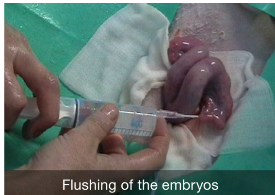
Flushing of the embryos