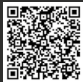
Scan to see detailed step by step instructions